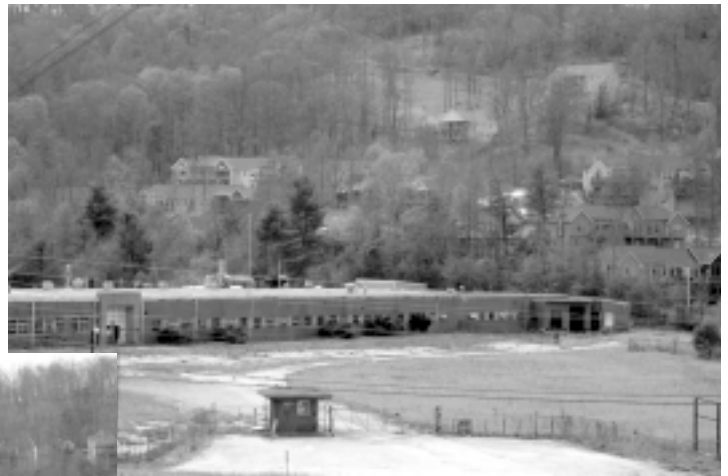
The CTS plant south of Asheville shut down in 1986, leaving a concentrated plume of solvents and toxic metals that may be poisoning wells and threatening air quality in nearby homes.

In the spring and summer of 2007, independent sampling of a nearby spring showed TCE at 293,000 parts per billion—more than 10 times higher than the 1999 level. Since that time additional testing has been conducted by local residents, local media and now, finally, EPA and NC are doing free testing of over 70 wells in the immediate area.