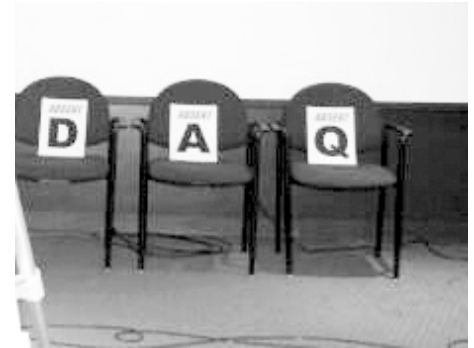
Empty chairs show that NC Div. of Air Quality declined to attend hearings on Cliffside organized by a coalition of citizens groups in Charlotte, Asheville and Raleigh.

Residents have successfully stopped the building of new coal plants in Utah, Wyoming, Minnesota, Delaware, Florida, Washington and Kansas already this year. We can do it in NC too! Email hope@cwfnc.org or 919-401-9600 to help us stop new big new power plants.