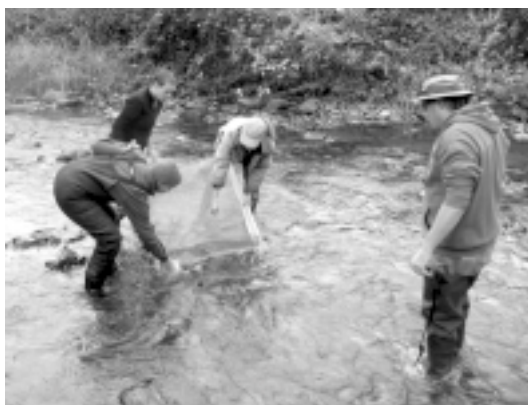
Participants in October SMIE training learn how to collect biological samples from a threatened creek.

Creek in Madison County, just downstream of a where a high end resort is being built and where developers have proposed to locate a new wastewater treatment plant (which is being challenged by Clean Water for NC and community group Laurel Valley Watch!). With 15 new volunteers as of October, the program has now trained nearly 100 residents to collect and identify aquatic insects, and to document and report water quality problems. The program has also strengthened awareness, built a reliable record of water quality over time and increased volunteer involvement in protecting water quality in the region.