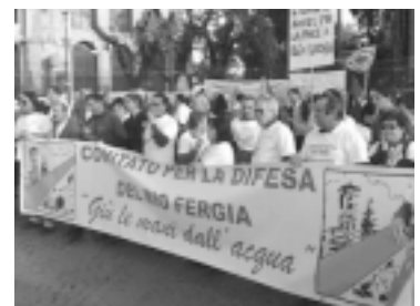
Water rights activists march through Rome on December 1st.

Based on reports from the Italian Forum of the Water Movements