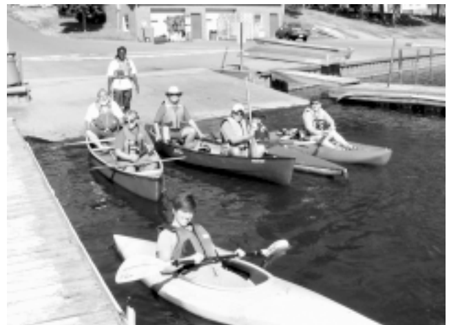
Some CWFNC participants in a Sunday morning canoe float on Salem Lake.

Many thanks to our speakers for great presentations, and to the Children Home in Winston-Salem, for hosting this event!