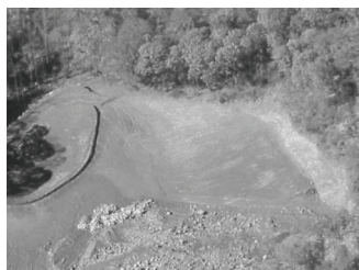
Mountain Air Golf Course was developed by removing trout stream buffers and putting the headwaters of Banks Creek into pipes

Almost seven years ago CWFNC and Banks Creek Citizens for Clean Water filed a state "contested case" against the state Dept. of Environment and Natural Resources' approval of a variance allowing the Yancey County golf developer to permanently modify the protective buffers on thousands of feet of a trout stream and put the stream in a pipe. After years of persistence, and a growing number of allies in this