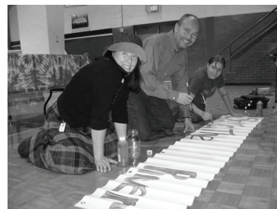
Cocke County Mayor Iliff McMahan works with CWEET raft guides Raven and Iris to make a banner for permit hearing.

Watch for plans for an upcoming event along the Pigeon involving organizations from both states, and other actions you can take to continue to build pressure for a clean, healthy River!