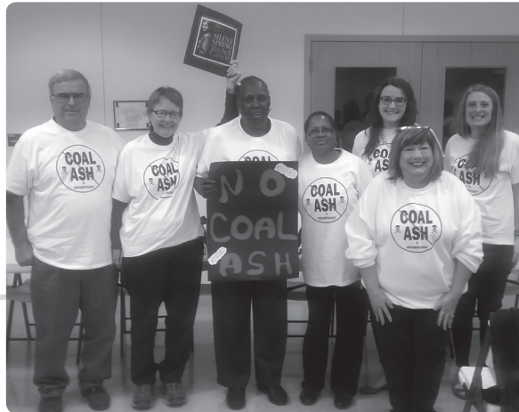
The leadership of Northampton Citizens Against Coal Ash (NCCA)