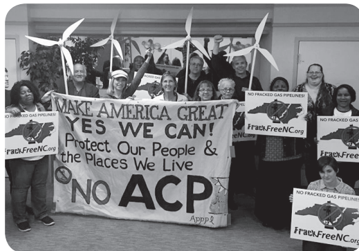
The Alliance to Protect the People and Places We Live (APPPL) and FrackFreeNC Alliance shown working together at the informal “people’s hearing” at the Fayetteville FERC comment session.

To find more “talking points” about problems with the DEIS, and find out how to submit comments, please visit FrackFreeNC.org or APPPL.org .