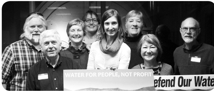
Clean Water for NC and local activists gathered in January to celebrate the Supreme Court decision!

The precedent set by Asheville's case reassures other