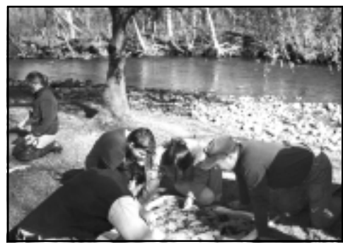
2003 - WNC Stream Monitoring Exchange started by CWFNC and allies, trained dozens of olunteer biological monitors throughout region