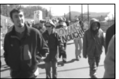
2008 - Hundreds of protestors, including CWFNC and grassroots NC and TN allies, march around Canton papermill to demand clean-up of Pigeon River and toxic air emissions