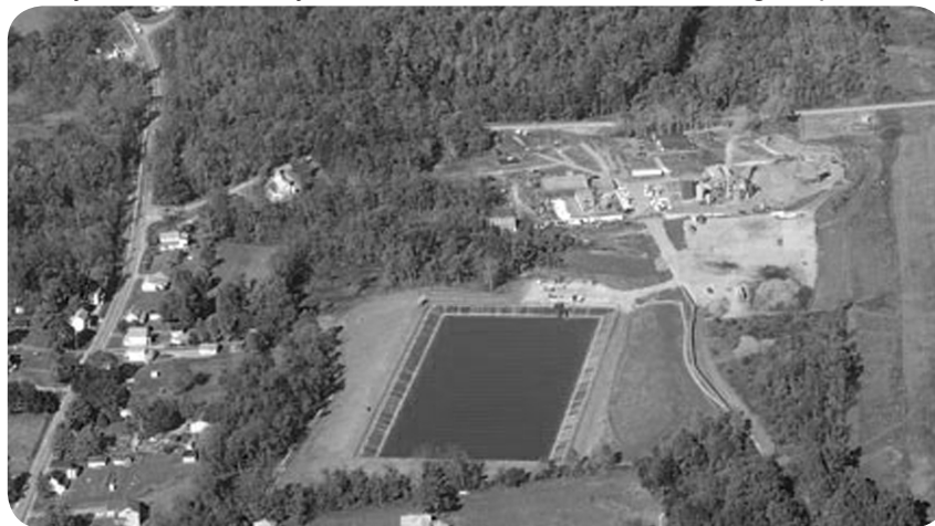
Drilling operations are often quite close to homes and housing developments (see road on left). The large wastewater containment/evaporation pond (center) releases strong odors and toxic compounds. The well pad and storage tanks (upper right) cause noise and toxic emissions.

ing and its relationship to drinking water resources. This report will include historical and ongoing case studies from several regions of the country, and will attempt to determine the cause of multiple groundwater contamination events. A 22 member Science Advisory Board of academics and experts in the fields of hydrology, toxicology, and drilling safety will analyze the data and is now asking for public comment.