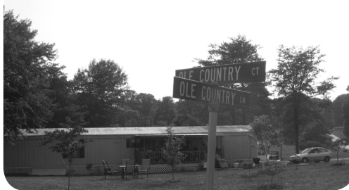
Country Valley Mobile Home Park, where the road you live on can determine how clean your water is and how much you pay for it.

$63 flat fee each month for sewer. Bills are often over $100, and once I was charged $300 before anyone figured out there was a leak!”