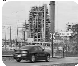
Progress Energy’s Sutton Coal Fired plant

line is designed to empower residents like you to participate in decisions about Clean Water Act “permits to pollute.”