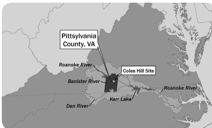
Map of mining site and downstream waters prepared by the Southern Environmental Law Center

voirs, Kerr Lake and Lake Gaston, that supply drinking water to both VA and NC towns. Many towns and counties in both states have passed resolutions calling on VA to keep its ban on uranium mining, as have river commissions in both states.