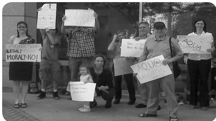
Aqua NC customers protest the rate increase in Raleigh

Aqua NC's Customers Lead the Charge for Affordable Water, Sewer