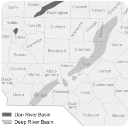
Map of Triassic Basin Shales, based on NC Geologic Service publication.

H ouse Bill 242 (Natural Gas/ Bonds/ Fees/ Studies), sponsored by Reps. Stone and Gillespie, passed the House in May with a vote of 117 to 2, and the Senate in mid-June. The deadline for the study has been moved back to May 1st, 2012 but it still lacks important protections including landowner protections to protect residents who are being ap-