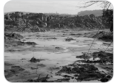
Aftermath of Kingston TVA Coal Plant ash dam disaster

The Environmental Protection Agency took public comment on proposed new rules for coal ash in 2010 but has not come to a decision. You stepped up in response to action alerts from CWFNC, and your calls, emails and petition signatures helped stop a bad amendment on the national Transportation Bill which would have prevented EPA from ever issuing federal public health safeguards related to coal ash waste.