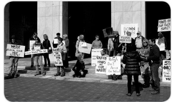
Buncombe County and Asheville residents rally for water decisions to be made locally in April.

Thanks for your participation in this fight for local control! Check back for updates and ways to get involved at http://ashevillewater.blogspot.com/