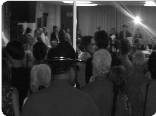
Above, frustrated grassroots lobbyists wait outside a Senate hearing on S820, moved to a smaller room at the last minute.