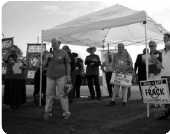
CWFNC, other Frack Free NC alliance partners, and elected officials spoke at the press conference before the Sanford Public Hearing.

has set. The MEC expects to send the final proposed rules to the legislative Rules Review Commission before the end of the year, but some rules may be “held back” for further review.